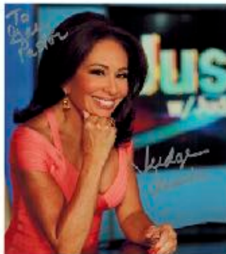
Judge Jeanine Pirro